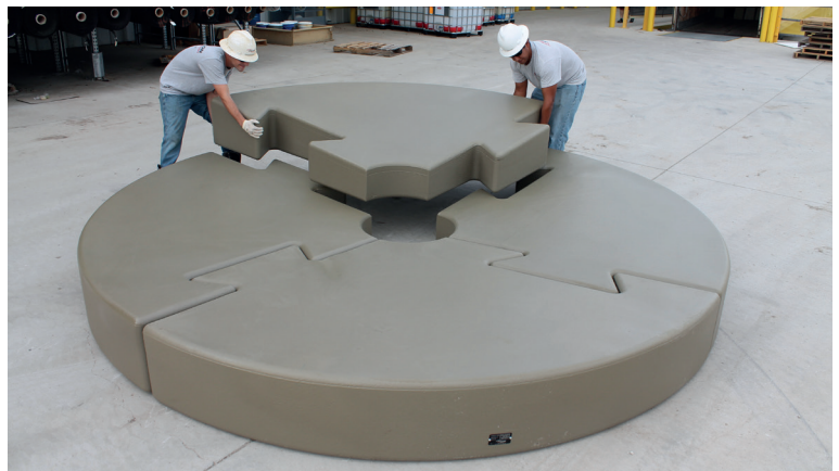
Cone bottom interlocking tank base

The unique interlocking design requires no tools to install. Typically, unpacking and installing a tank base takes no more than 5 minutes. Its light weight easily allows small adjustments just before tank setting, which reduces the need for crane level adjustments.