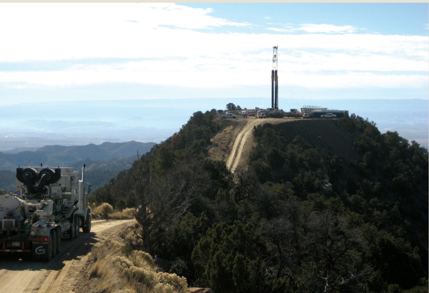
A Calfrac Well Services crew works the Lone Mountain frack site along the mesas in western Colorado at high altitude and sometimes in harsh conditions.

CARBO also now has an application. The iPhone version of the Fracpro Remote application lets operators log into frack jobs from a remote location and get real-time data.