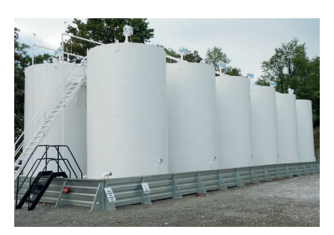
SITEGUARD secondary containment systems have been installed in more than 8,000 locations with a 100% environmental success rate.

Each system is custom built to fit your site and SPCC requirements. The SITEGUARD seamless secondary containment system is backed with an 18-month warranty.